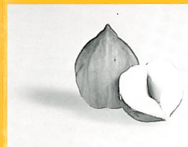
Magra 4 for hazelnuts