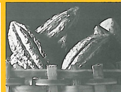
Magra 12 for cocoa beans